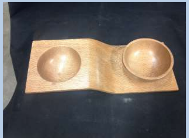
COLIN's double-ended bowl. No one could figure out the process he used. Can you?