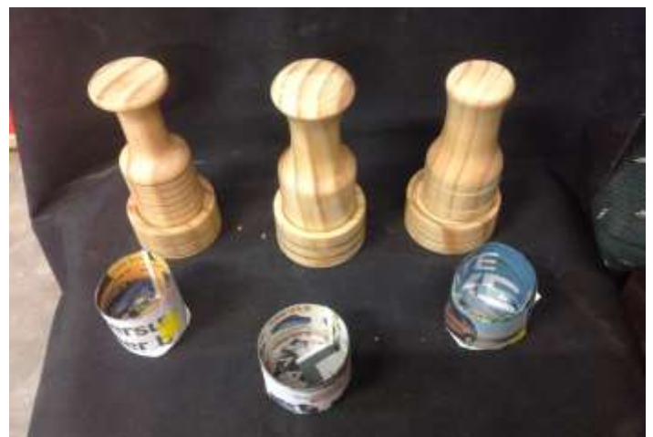
Wednesday's new crew completed the paper-pots project. Well done fellas!