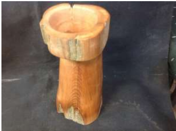
STEPHEN's lathe has been busy again.