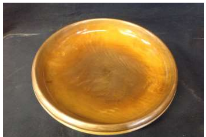
ROBERT's English plane bowl has been air-brushed then sprayed with lacquer.