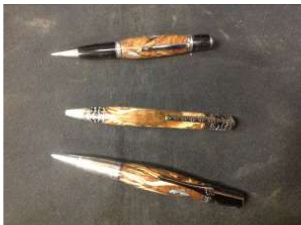
GIDEON , our irrepressible experimenter, turned these pens using the core of a pine cone.