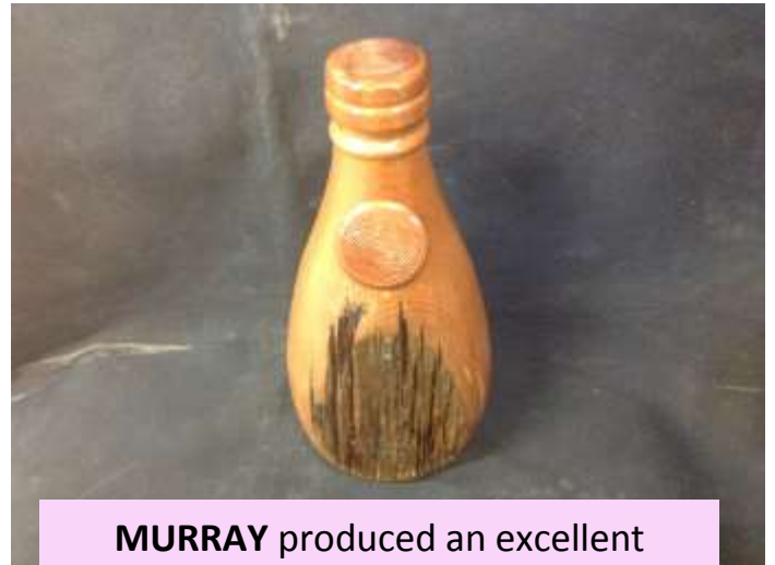
MURRAY produced an excellent model of a totara-post form