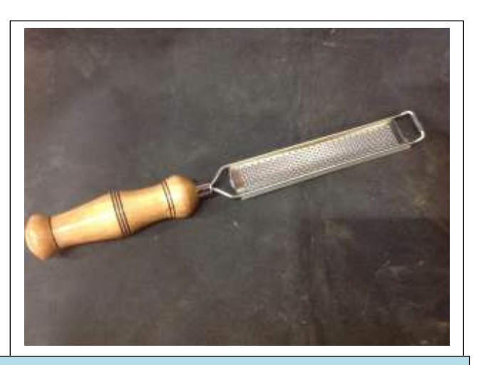
SPENCER's excellent handle for a grater.