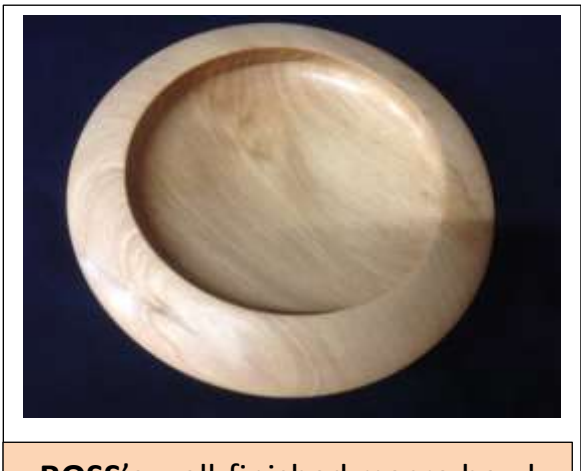
ROSS' s well-finished macro bowl