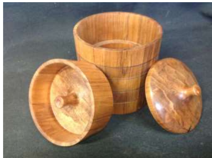
Left above: STEPHEN O'Connor produced this beautiful RIMU lidded wood pot. The right hand picture shows the opened pot with an internal 'secret' compartment. A great idea and very skilful turning.