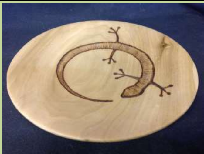
RICHARD's flair has been let loose again. This time it's with pyrography work as embellishment on a shallow plate. Woo Hoo! What a cracker job.