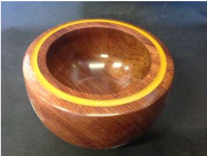
JOHN'S first attempt at resin inlay and a super outcome too. This special turning will no doubt open many doors for upcoming projects.