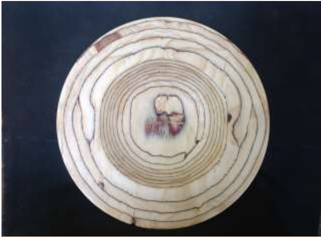
CAELAN turned a large bowl from a block of pine laminate. The wood is discard material from the fibre-glassed keel of a 40 foot boat.