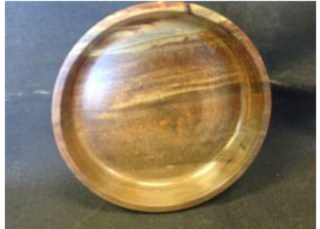
JAMES looks for and often finds random colour splashes in wood grain. This very smart swamp kauri bowl is a very good example colour searches.